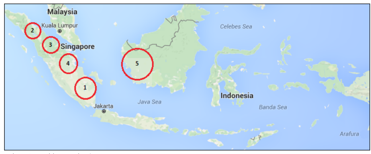
Indonesian Rubber Production Map

Indonesia is considered a strong player in the automotive component sector with an experience of more than 20 years in the industry. One of the best potential products in the automotive component industry is tyre. Currently there are 14 companies producing a wide range of tyres for different types of vehicles from small sedan, sports utility vehicle (SUV), and multi-purpose vehicle (MPV), to heavy equipment such as bus and truck as well as motorcycles. According to the Ministry of Industry, as of March 2016, the national tyre production capacity reached 77 million pieces for transportation vehicles (car, bus, trucks and heavy vehicles) and also 64 million pieces of motorcycle tyres.