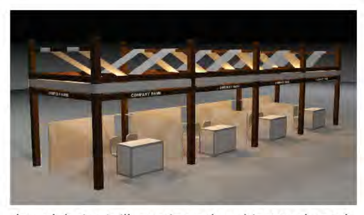
(stand design is illustration only, subject to change)